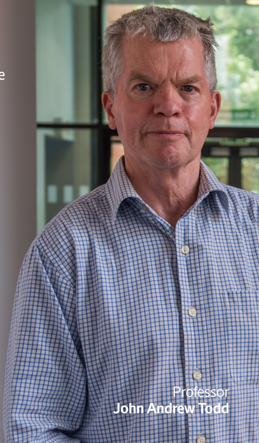
Professor John Andrew Todd